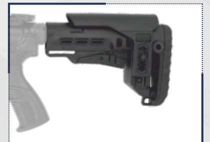
Telescopic Buttstock Stock No: 00111