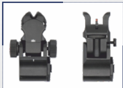
LPA MAS7COM Sight Set Stock No: 00093