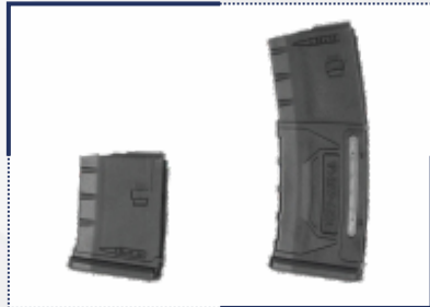
Polymer MAG 10RD Stock No: 00059 Polymer MAG 30RD Stock No: 00056