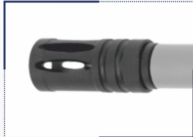
Muzzle Brake Stock No: 00066