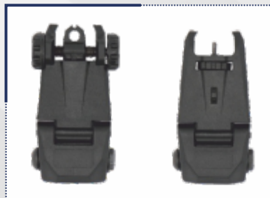
Polymer Sight Set Stock No: 00110