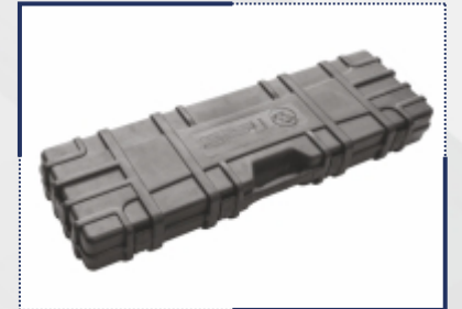
Polymer Rifle Case Stock No: 00078