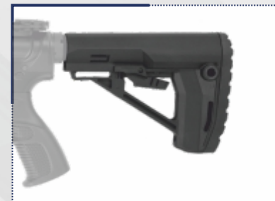
Collapsible Buttstock Stock No: 00028